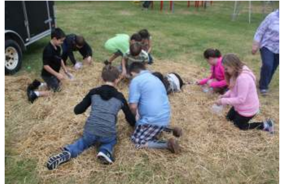
Digging for Treasure