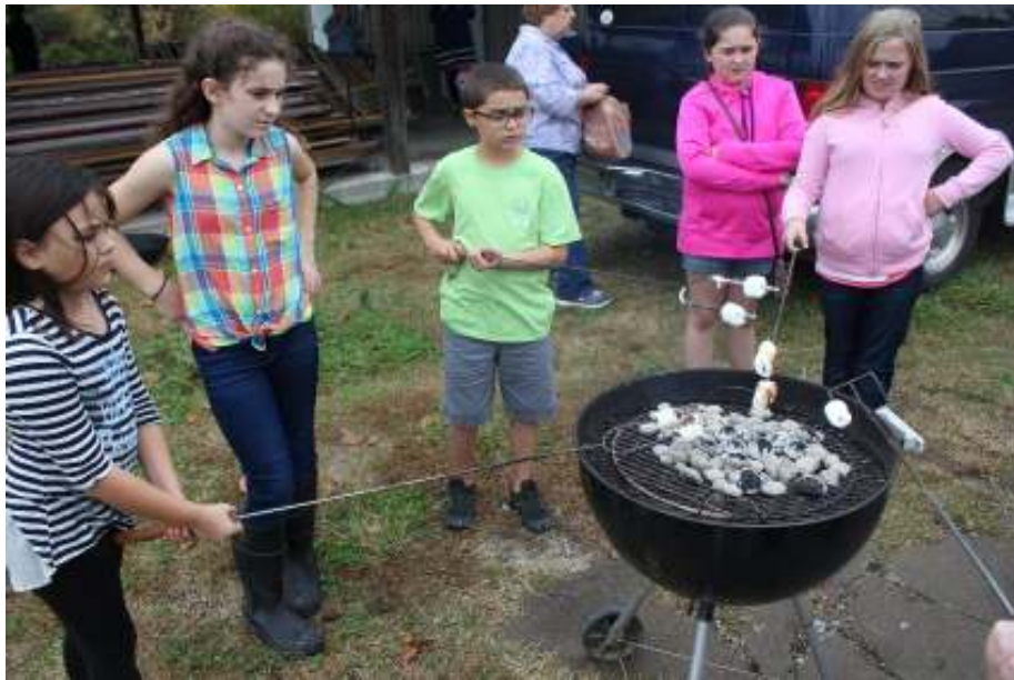
Children's Party Marshmallows and S'mores