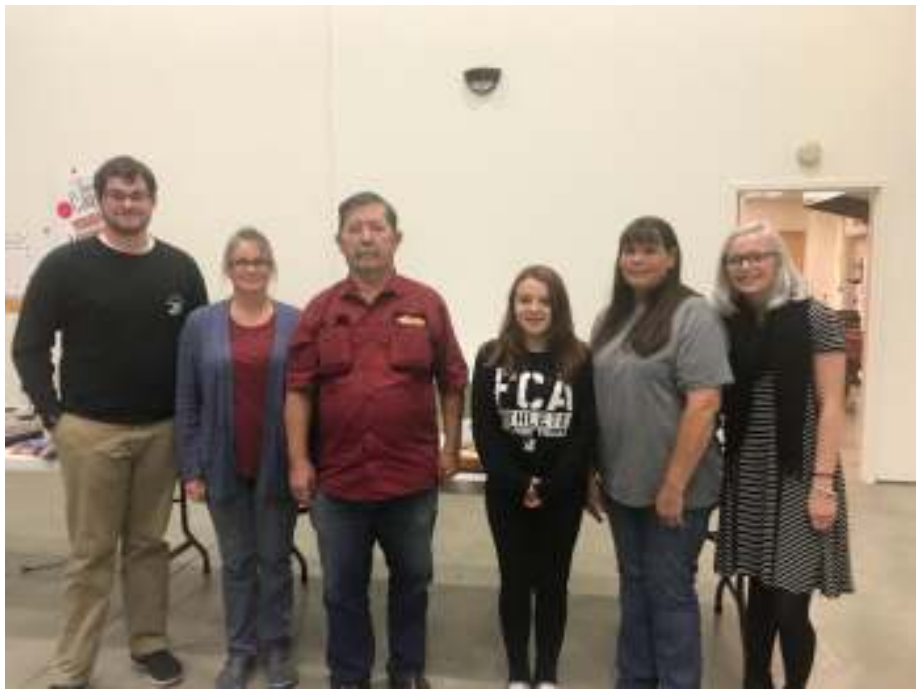
Birthdays in November