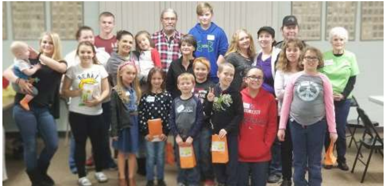
Week One at Gorham