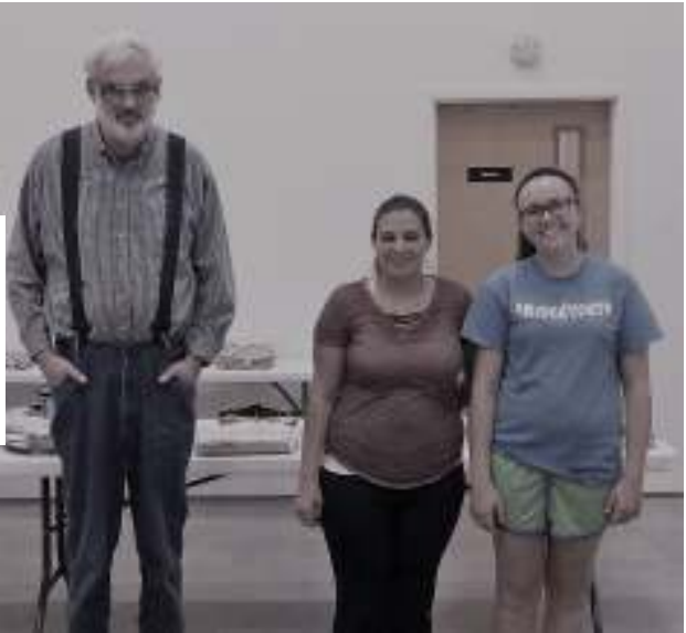
October Birthday Potluck